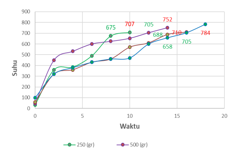
Figure 4. Graph of Melting temperature and time at volume 250, 500, 750 and 1000 grams of waste aluminum metal

There is a difference in the melting point of each of these performance tests due to differences in the material being melted down because it comes from various brands and types of motorcycle canvas waste. It can also be seen that dirt and other metal mixtures affect the melting temperature and time, as shown in Table 1.