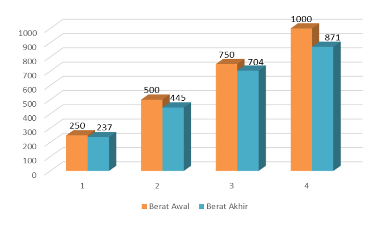
Figure 6. Graph of depreciation of raw materials into materials after being smelted/melted

The performance test results can also be seen in the yield of each tested material (figure 6.). The percentage yield of the tested materials was 94.80%, respectively; 89.00%; 93.87%, and 87.10%. The performance test results of the highest product were on a fabric with a weight of 250gr, and the average product was 91.19%.