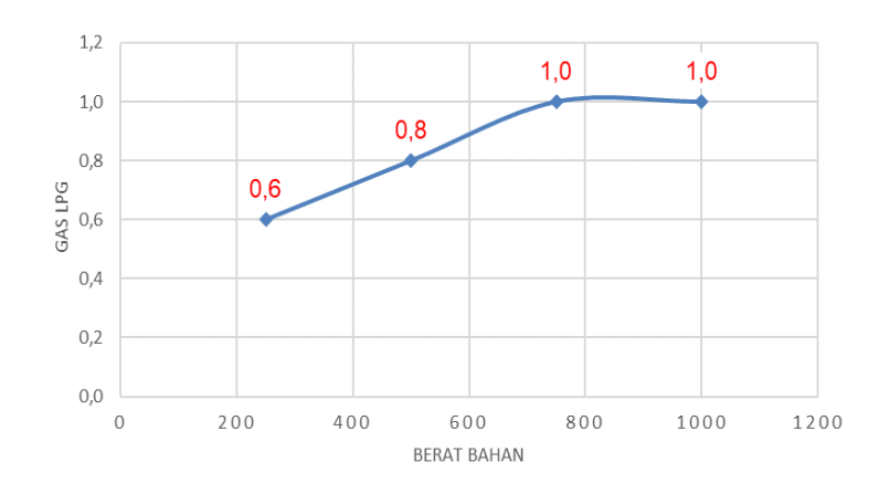
Figure 5. Graph of LPG gas consumption on the melted/melted material