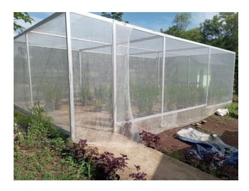
Figure 2. The appearance of the netting house

The advantage of using a netting house application is the length of irradiation and the intensity of light according to the needs of the rice plant. Extended irradiation can affect the flowering process. In the research of Warner and John (2003), the application of 8 hours irradiation on Rhododendron plants will increase the number of flower initiations.