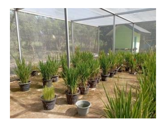
Figure 3. Rice plants in the netting house

Rice plants in the netting house are tall and short because of the influence of the climate. Suprihatno's research (2010) stated that climatic and weather factors could cause the characteristics of plant height that have a short size.