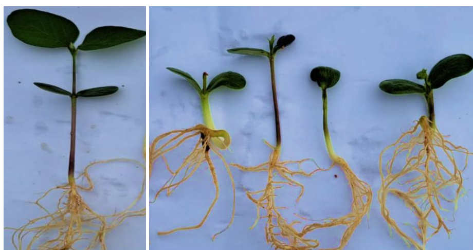
Figure 1. Graph of antioxidant levels in Buffalo curd

In Figure 1, an abnormal M4 germination was found. Picture A normal germination and picture B abnormal germination (do not have primary leaves, epicotyl and short and thick hypocotyl). In the [6] study on M1 soybeans, the mutation-induced seeds had low germination, this indicated that there were abnormal germination. In the M4 generation, it is suspected that the effect of mutation induction has no effect on germination. According [7] research, the Grobogan variety has the highest or most sensitive radiosensitivity level and the Gepak Kuning variety has the lowest radiosensitivity level or the least sensitive to gamma ray irradiation.