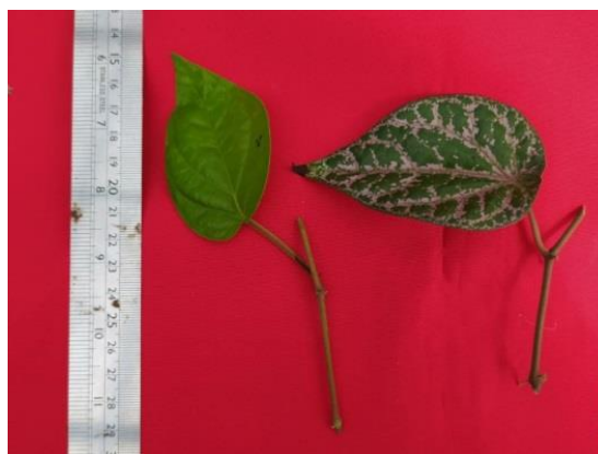
Figure 1. Cuttings of green betel and red betel plants.

The cuttings of green betel and red betel were cut with two books/one segment and one leaf (Figure 1). There was a significant interaction between betel type and Rootone F concentration to the percentage of life and shoot length (Table 1). Green betel has given Rootone-F 25 ppm, and 100% coconut water had a lower life percentage than other treatment concentrations and water. Red betel has given Rootone-F 15 ppm, and coconut water 50% has a lower life percentage than other concentrations and water. Application of Rootone-F above 120 ppm has inhibited the growth of sandalwood ( Santalum album Linn) stump; this means plant growth regulators above the concentration considered too high, exceeding optimal dose for growth and potential damage and poisoning plants [10].